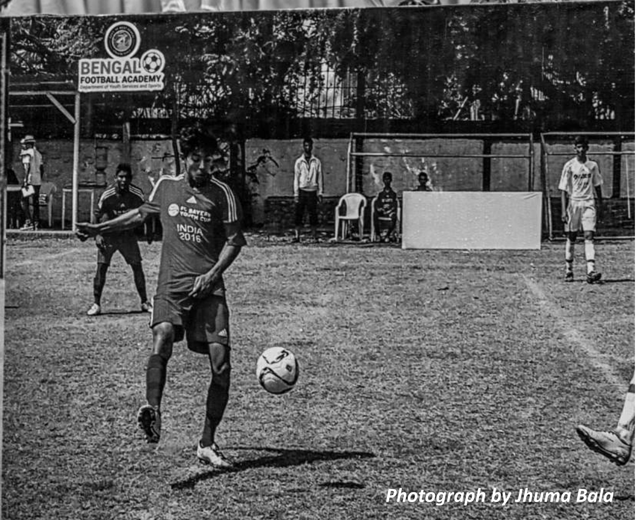
Photograph by Jhuma Bala